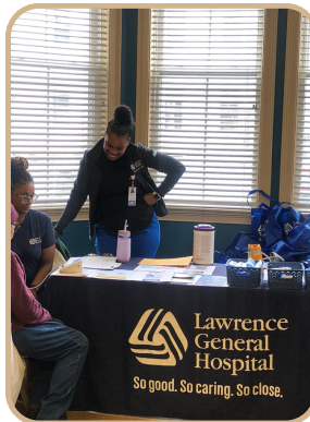
Diabetes Alert Day with LGH