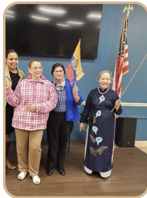
Celebrated International Women's Day