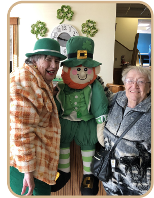
Spread a little St. Patrick's Day "Lucky Charm"