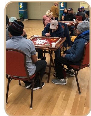
Let the game begin! Domino Tournament